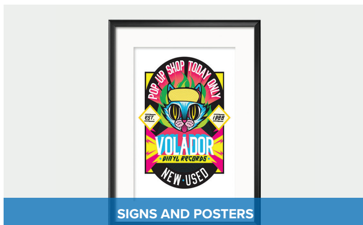
SIGNS AND POSTERS