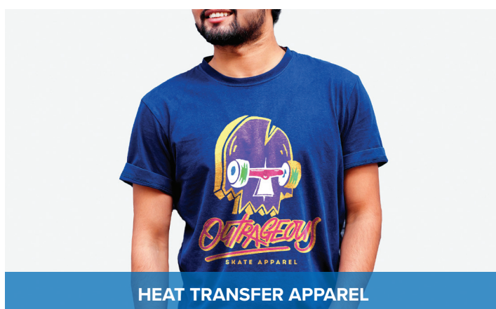
HEAT TRANSFER APPAREL